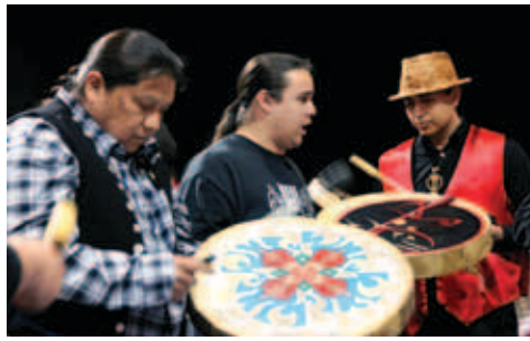
A coastal group gracefully honors Billy with mesmerizing traditional songs.