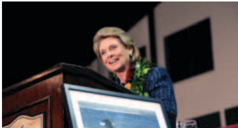
Gov. Chris Gregoire gallantly gets the guests engaged as she gives one of her best speeches.

Billy's party was a huge success and a timeless event, thanks to the year-long planning of the Northwest Indian Fisheries Commission, Squaxin Island Tribe and support of many of the tribes in western Washington. Billy is truly one in a trillion. We can't all possess the gifts that Billy does but we sure can learn all that we can from him and we can work to help him restore and protect the environment while working together!