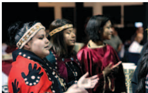
A Squaxin Island singing group serenades Billy.

decorated room filled with an array of tables cascading with food, including traditionally cooked salmon, clams, elk, turkey, vegetables, fruit, decadent desserts, birthday cake and a complete oyster bar that was provided and staffed by Taylor Shellfish. Joining in this monumental celebration were more than 500 people, including political dignitaries from throughout the country, tribal leaders, and Billy's closest family and friends.